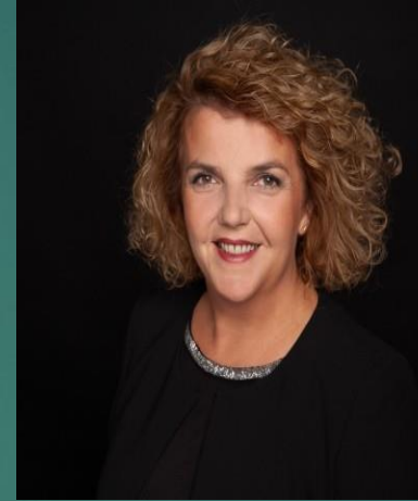
Isabelle Bogl Communication